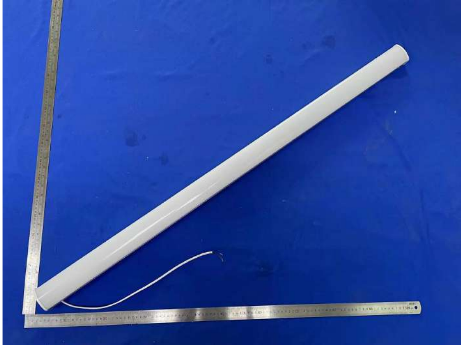
Photo 1 General Appearance of the EUT